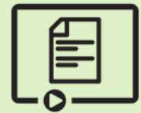
Articles & videos