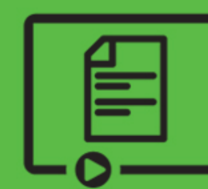
Articles & videos